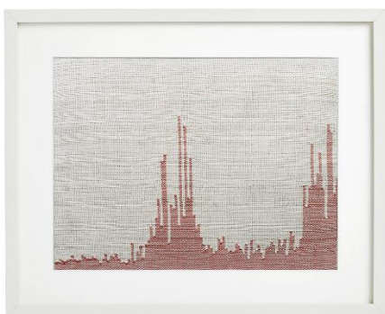
Image 3 - Doerte Weber, San Antonio Stats - Covid Moments Series, 2020